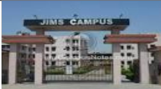
JIMS Engineering Management Technical Campus Knowledge Park-III, Greater Noida, U.P.