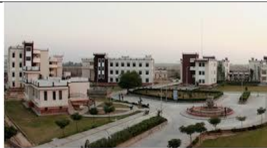
Jagannath University Village Rampura, Tehsil Chakshu, Jaipur (Rajasthan)