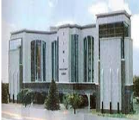
Jagannath Institute of Management Sciences JIMS Vasant Kunj-II, Plot no- 3, Institutional Area, Phase -II, Vasant Kunj, New Delhi- 110070