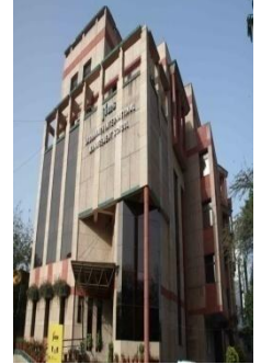
Jagannath International Management School MOR, Pocket 105, Kalkaji, New Delhi