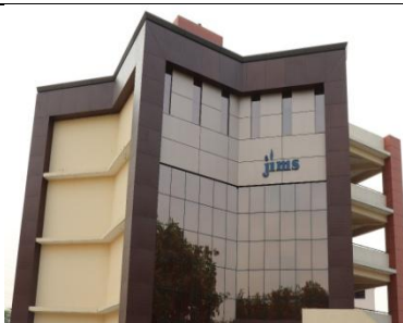
Delhi Institute of Higher Education Plot No. 20 C, Techzone – IV, Noida Extension (U.P.)