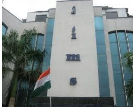
Jagannath International Management School OCF, Pocket-9, Sector-B, Vasant Kunj, New Delhi