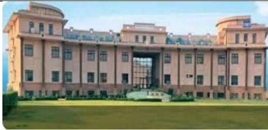
Jagannath Gupta Institute of Engg. & Technology Plot No. IP 2 & 3, Phase-IV, Sitapura Indl. Area, Jaipur (Rajasthan)