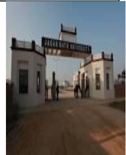
Jagannath University BahadurGarh (Haryana)