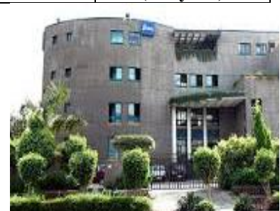
Jagan Institute of Management Studies 3, Institutional Area, Sector-5, Rohini, New Delhi